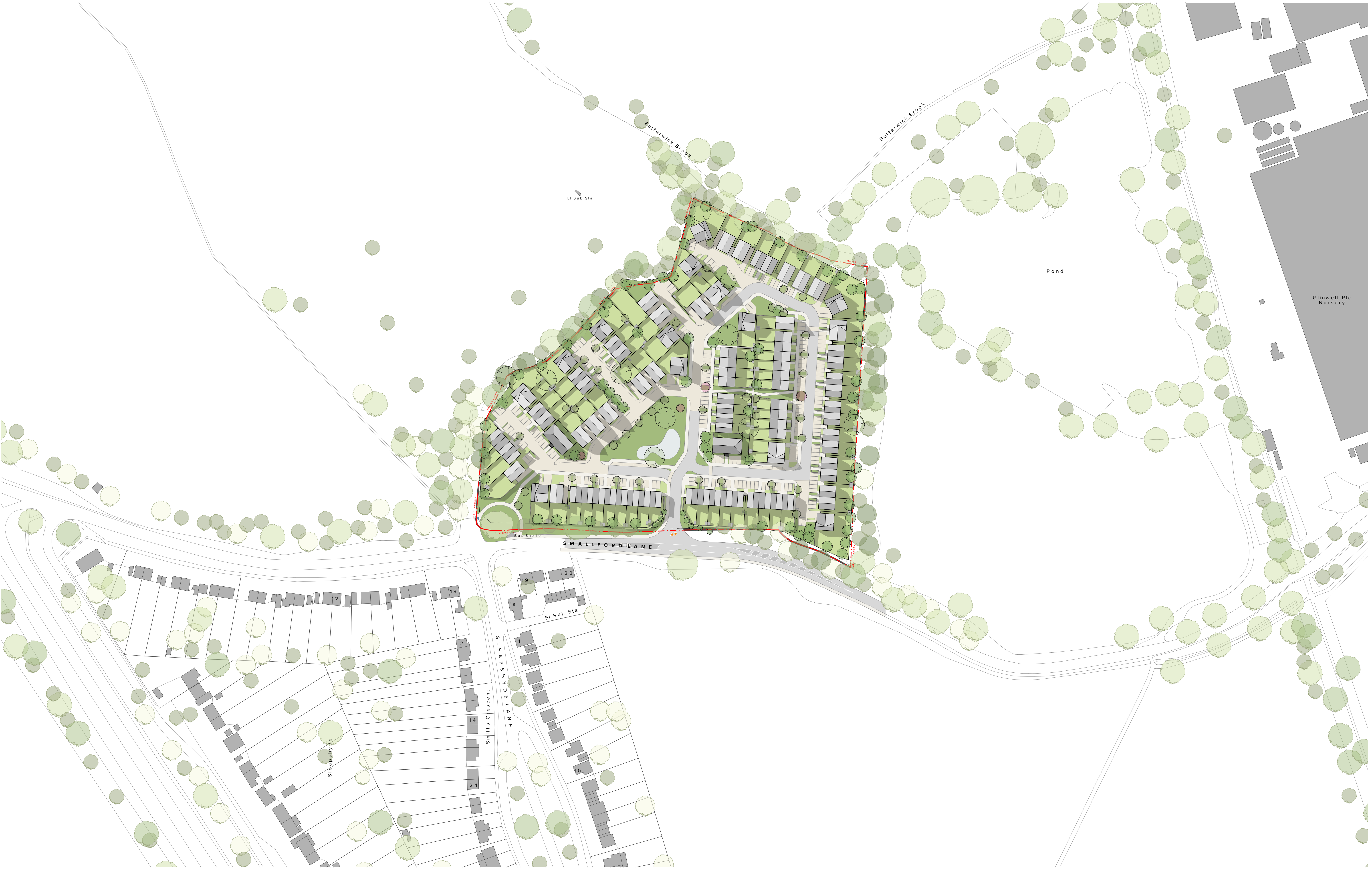
Proposed Site Plan 1:1000

Notes THIS DRAWING IS COPYRIGHT © OF TURNER. NO REPRODUCTION WITHOUT PERMISSION. UNLESS NOTED OTHERWISE THIS DRAWING IS NOT FOR CONSTRUCTION. ALL DIMENSIONS AND LEVELS ARE TO BE CHECKED ON SITE PRIOR TO THE COMMENCEMENT OF WORK. REPORT TURNER OF ANY DISCREPANCIES FOR CLARIFICATION BEFORE PROCEEDING WITH WORK. DRAWINGS ARE NOT TO BE SCALED. USE ONLY FIGURED DIMENSIONS. REFER TO CONSULTANT DOCUMENTATION FOR FURTHER INFORMATION. Areas and apartment numbers have been calculated in accordance with the NCS355A code of Measuring Practice (9th edition, 2015) using the latest software (MA, Ltd, Ltd) and the latest edition of the code. All measurements are made on the basis of these predictions, whether as to project stability, pre-laying, lease agreements, compensation and in the future should make the drawings for the building, design development, structural design, site levels and site dimensions, construction method and building tolerances, Local Authority and statutory consents.